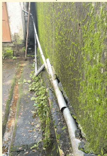
Water Gets Stored in Underground Circular Well