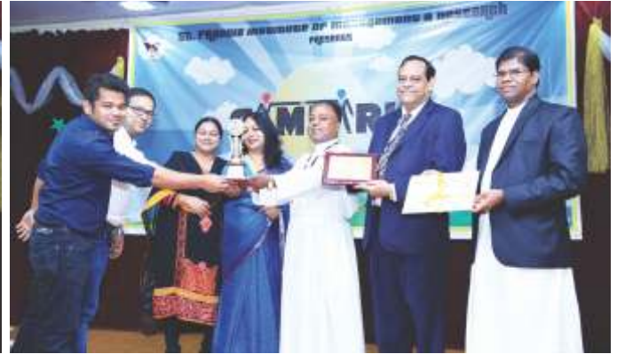
Team Messaggio Batch (2008-10) was felicitated with Entrepreneurial Excellence Award.