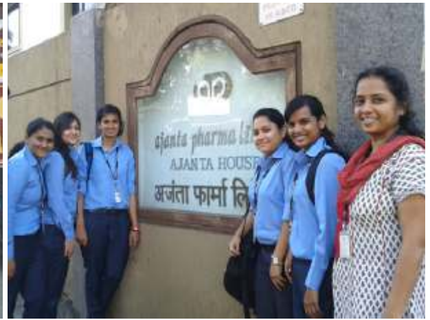
Field Visit organized for Students to Ajanta Pharma