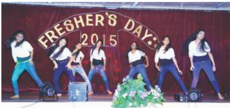
Sizzling Dance Performances by Second Year Students

The contest was judged by the 2 nd and 3 rd year students representing from each programme. It was a wonderful evening well spent and we hope that as much as we enjoyed organizing the program, the first year students too enjoyed participating in it and felt welcomed to this prestigious Institute.