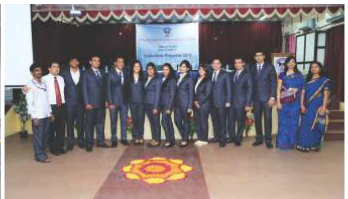
Group Photo - Organizing Team