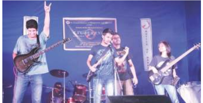
Battle of Bands - Live Band Competition