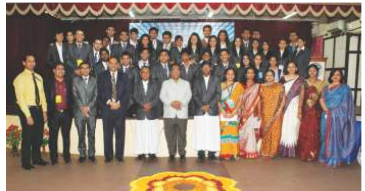
Group Photo - Organizing Team