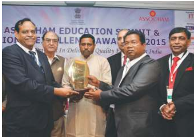
SFIMAR received "The Most Upcoming B-School Award 2015" by ASSOCHAM