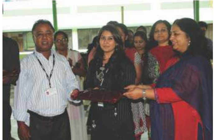
INTERNATIONAL WOMENS DAY