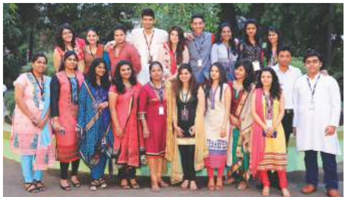
Fun Unlimited @ Sampark 2015