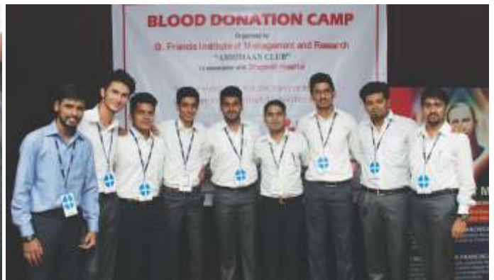
Blood Donation Drive organized on Founder's Day