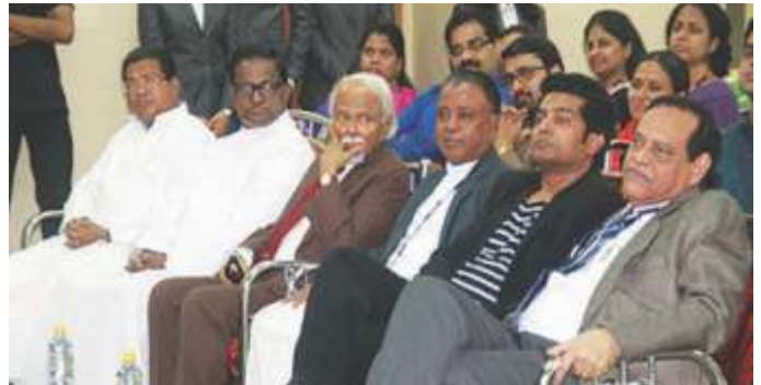
Dignitaries present at Valedictory Function