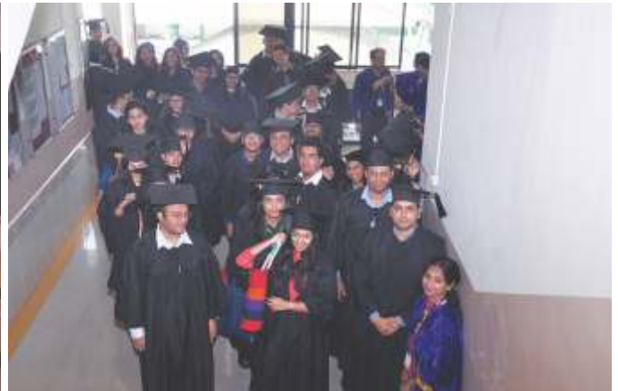
Students all set with their Graduation hoods for the Procession