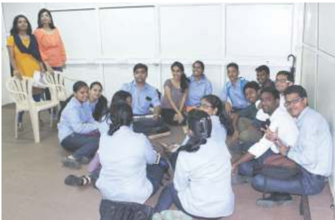
Idea Generation Workshop was organized by Prerna - Entrepreneurship Club