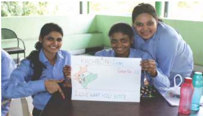
Students displaying their poster during poster-making competition organized by DLLE