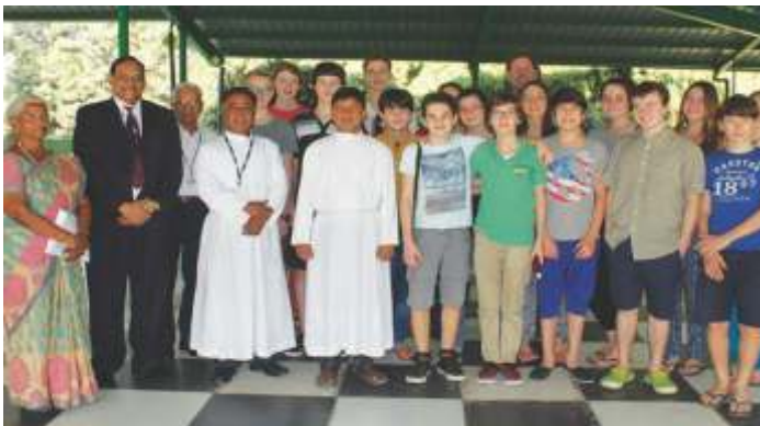
Group of German Students & Faculty visited SFIMAR Campus