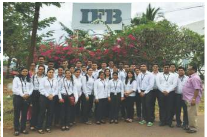
Industrial Visit to IFB Industries, Goa