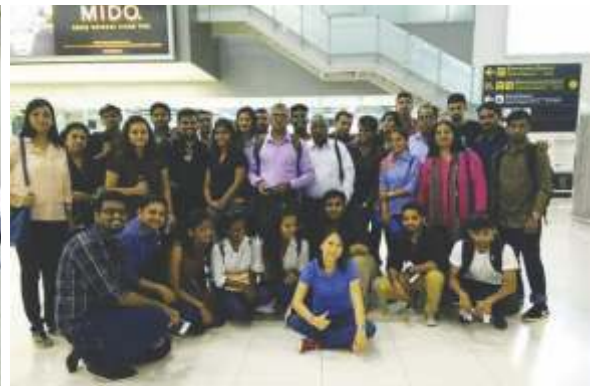
Visit to Mido Swiss Watches, Thailand