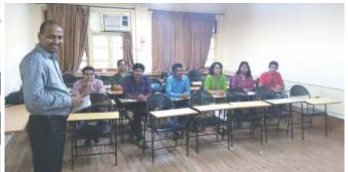
Guest Lectures by Eminent Industry Professionals