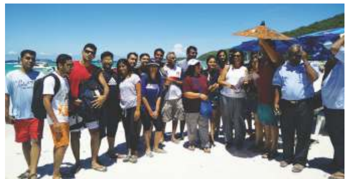
Enjoying the beaches at Coral Islands, Pattaya