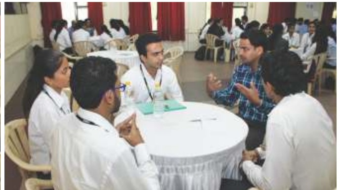
Grooming Sessions conducted by our Alumni Members