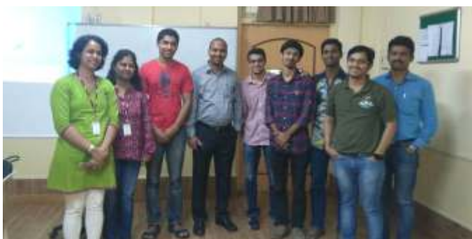
Students working on group assignments