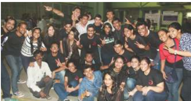
Students enjoying the DJ Nite