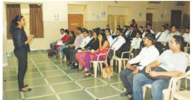
Personality Grooming Sessions for Students