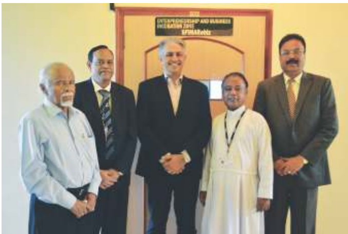
Inauguration of Business Incubation Zone (SFIMAReBiz)