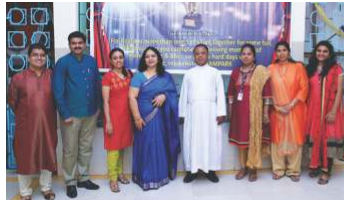
Group Photo - Organizing Team