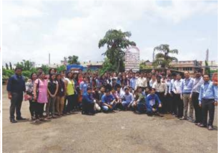
Industrial Visit to Parle Biscuit Factory, Khopoli