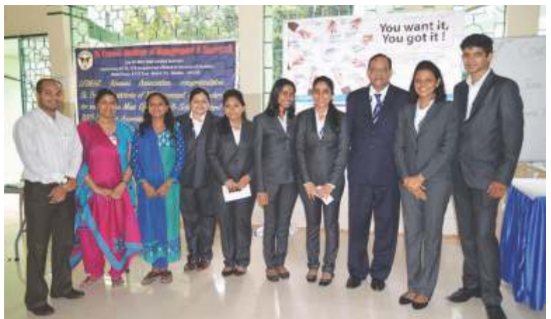
Organizing Team - Entrepreneur in You