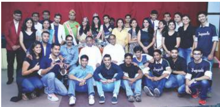
Group Photo - Organizing Team & Participants