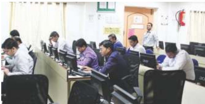
Regular Aptitude Tests are conducted for students