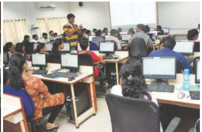
MS-Excel 2013 - Advance Level Training was organized for students