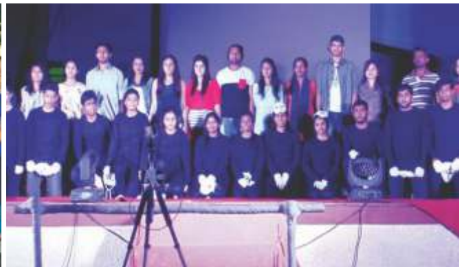
SFIMAR Students performing at SFITI Golden Jubilee Celebrations