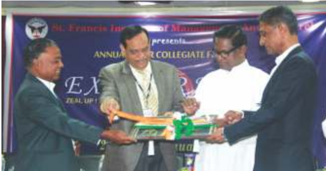
Inauguration of Exuberance 2016