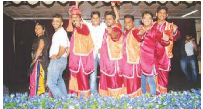
Cultural Performances showcased by MMS, PGDM & Part-Time Students