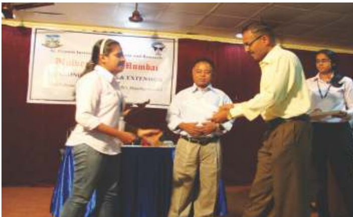
Student volunteer felicitated on successful completion of DLLE Activity in association with University of Mumbai