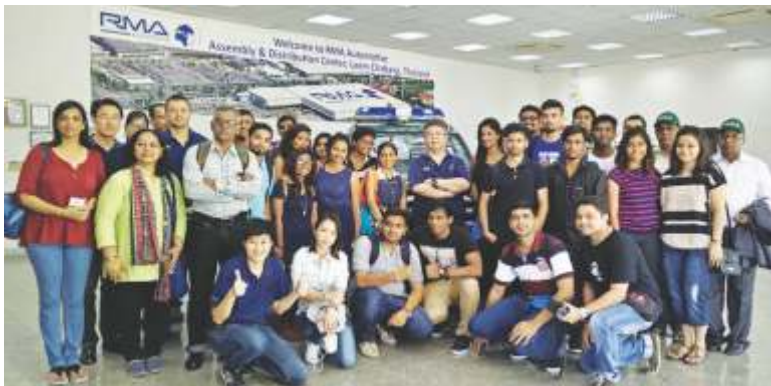
Visit to RMA Automotive, Thailand