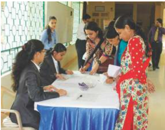
Students managing the Registrations for the Programme