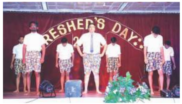
Hilarious Dance Style showcased by MMS & PGDM Students