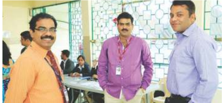
Faculty Members interacting with Alumni