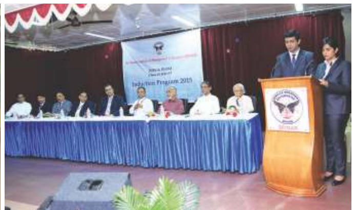
Chief Guest, Dignitaries, & EC Members present on the Dais