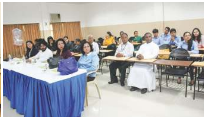
Corporate Panel evaluating HR & IR Projects