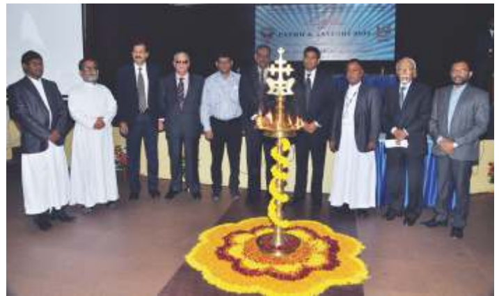
Dignitaries present at the event