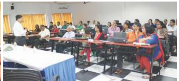
Interactive Session between the Trainer & Participants