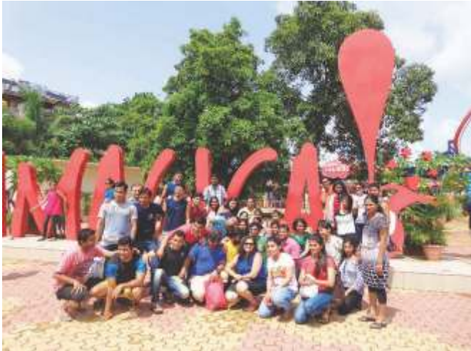
Fun Unlimited @ Aquamagica

Part-Time students went for an Industrial Visit on 1 st and 2 nd August 2015 to Khopoli-Parle Biscuits Ltd. It was a learning experience for the students as detailed processes were explained to students. 80 students alongwith faculty members visited the factory. Students also visited AquaMagica - Theme Park after the Industrial Visit and enjoyed the rides and food at the theme park.