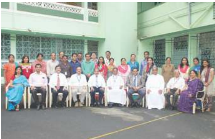
ISO Auditors from DNV with SFIMAR Fraternity