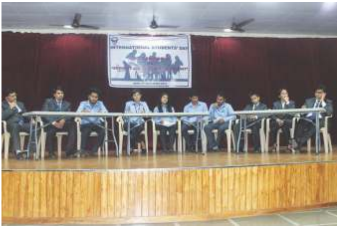
INTERNATIONAL STUDENT'S DAY