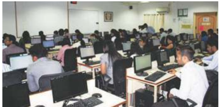
Regular Aptitude tests are conducted for MMS & PGDM Students