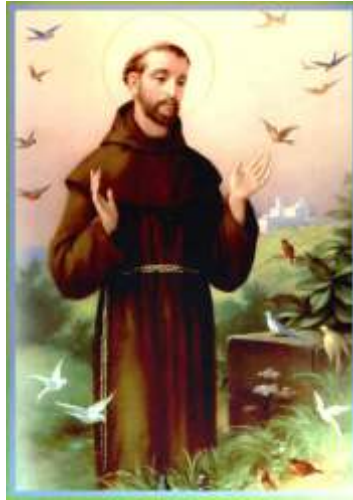
ST. FRANCIS OF ASSISI