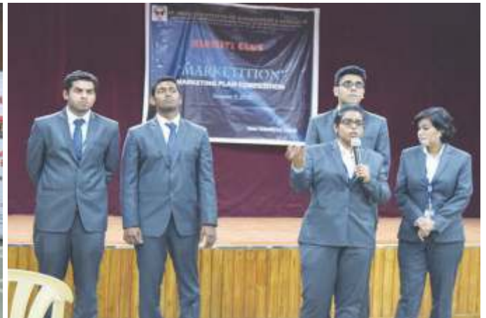
Nirmiti Forum organized an Marketing Plan Competition for MMS Students