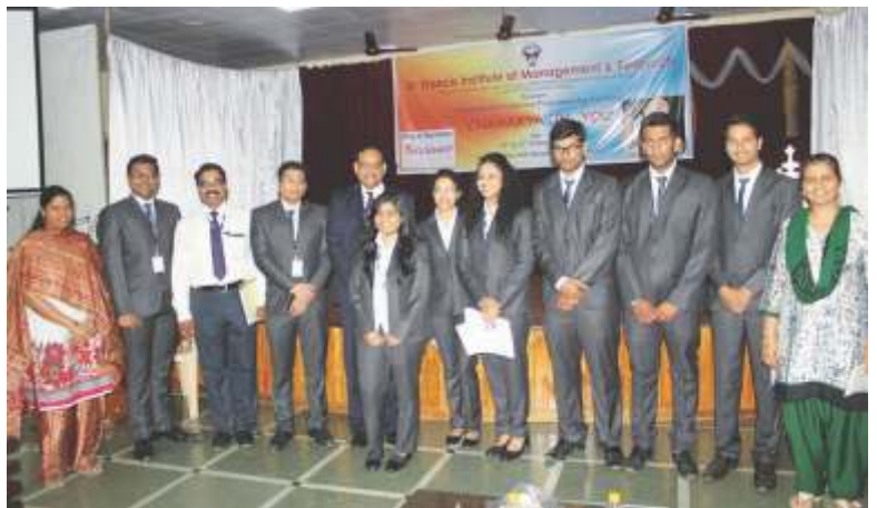
Organizing Team - Chanakya in You