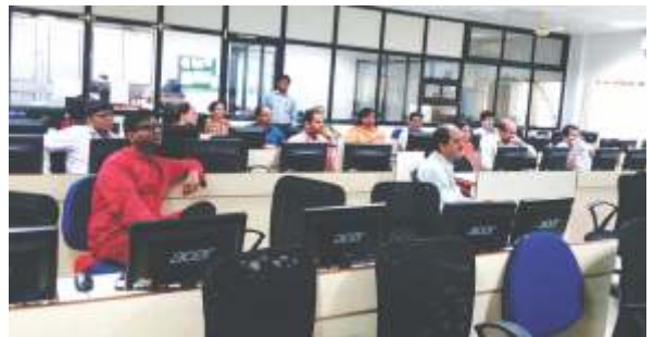
Faculty Members attending ERP Training

Inauguration of SFIMAR Entrepreneurship & Business Incubation Zone (SFIMAR ebiz).