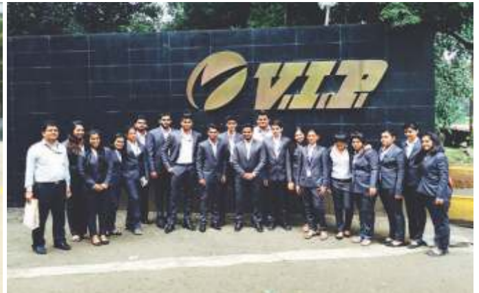
Industrial Visit to VIP, Nashik