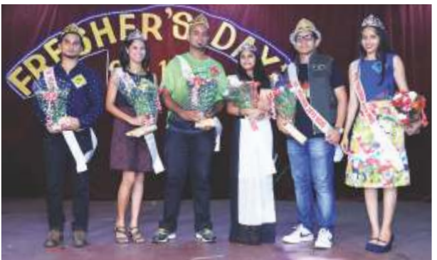
Mr. Fresher & Ms. Fresher 2015 (MMS, PGDM & Part-Time Programme)