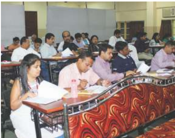
Participants working on their assignments