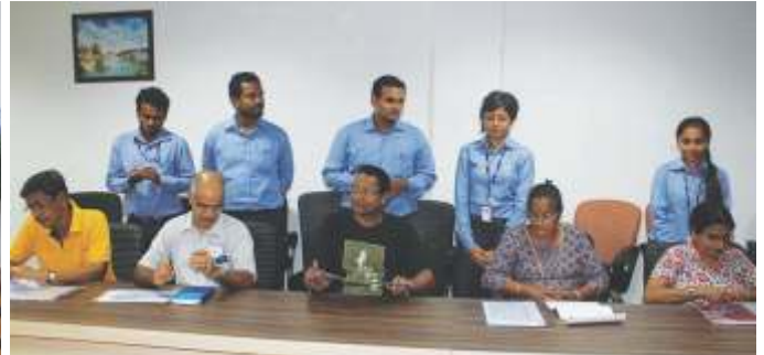
Participants & their Student Mentors