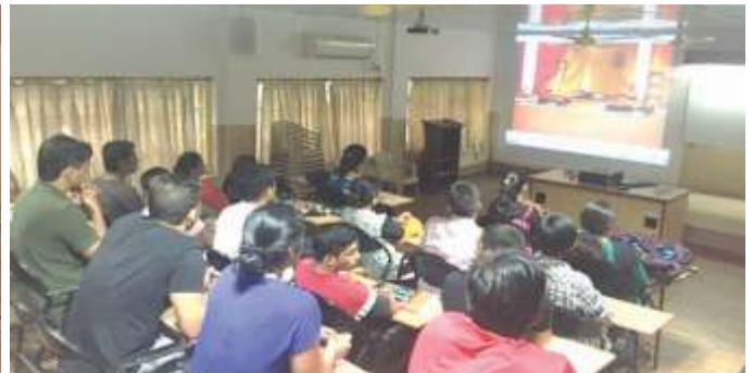
International Yoga Day Celebrations