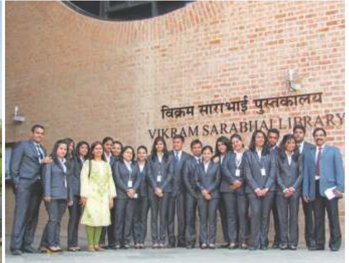
Study Tour to IIM-Ahmedabad