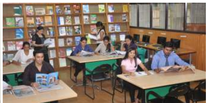
Reading Hours are regularly conducted for Students