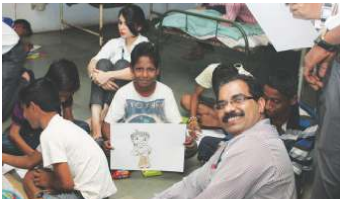
Visit to Swagat Daya Ashram on World Aids Day