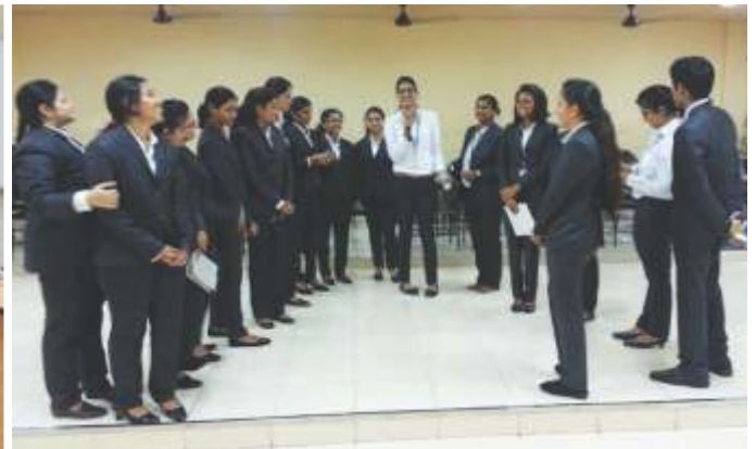
Renaissance - HR Club organized Training on Team Building & Corporate Grooming