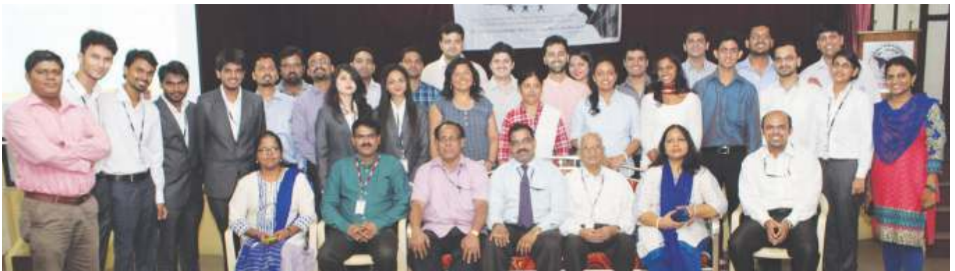
Group Photo - Alumni Connect