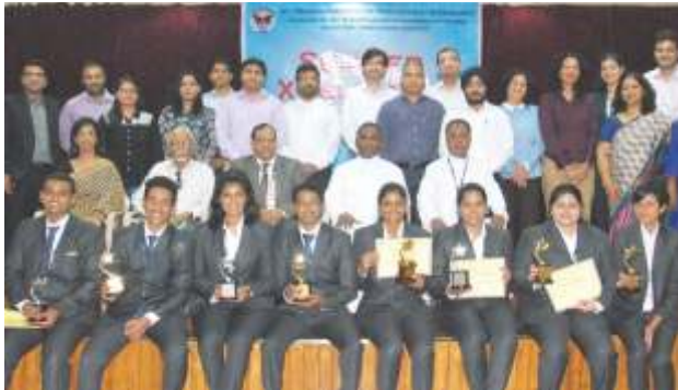
Winners of Summer Xcellence 2015 along with Judges & Faculty Guides

Summer Xcellence is an intra-collegiate Summer Project Competition among students. Students undergo summer internships with companies and work on practical aspects of business issues confronted by them. They present their findings in their summer project reports and defend them in a highly competitive environment. Best projects are then selected by a panel of internal faculty and students are then required to present them in front of a panel of industry experts.