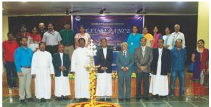
Organizing Team - Exuberance 2016