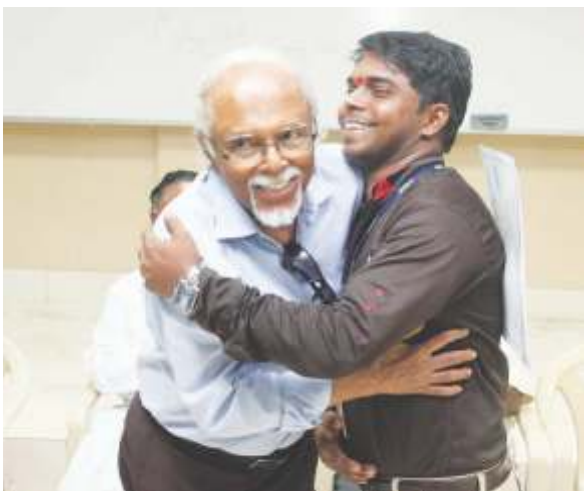
A learning bond between Participant & Mentor