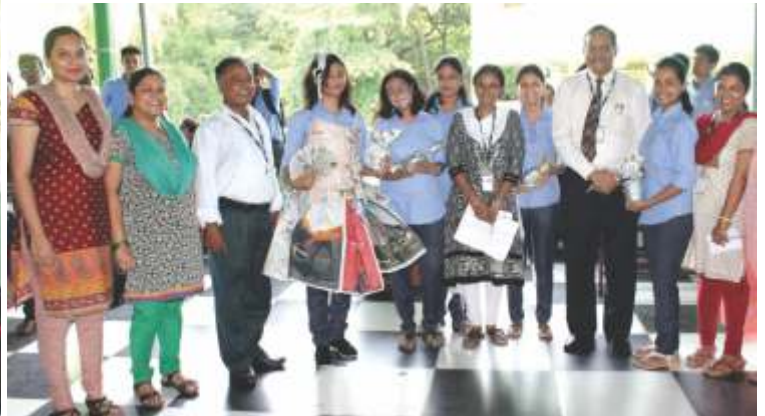
Malay - Fine Arts Club organized "Best out of Waste Competition" for MMS & PGDM Students