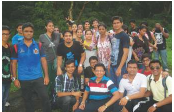
Adventure Club organized a Trek for Faculty & Students to Kanheri Caves, Borivali