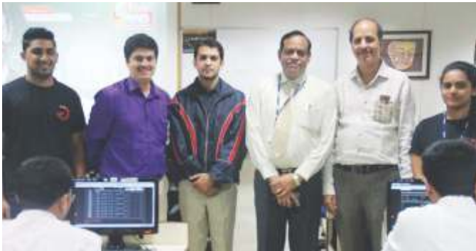
Trade Guru - Mock Stock Competition