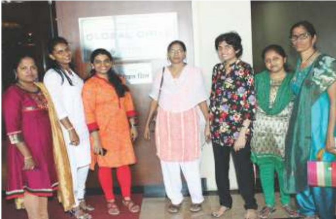
Faculty & Staff outing to Global Grill Restaurant, Mumbai