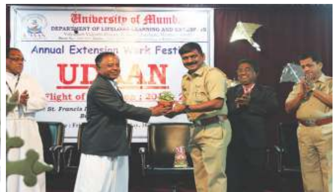
Dignitaries present for Udaan - DLLE Annual Festival