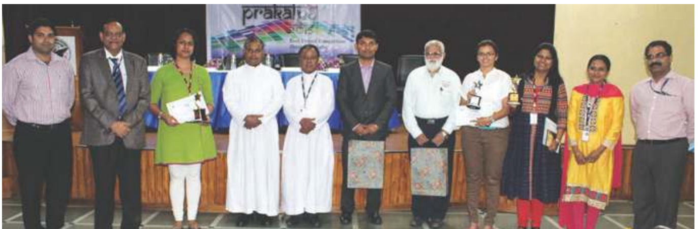
Group Photo - Winners of Prakalpa 2015 with Dignitaries & Faculty Members