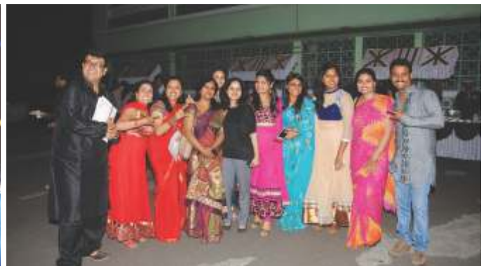
Students enjoying @ Luminance 2015