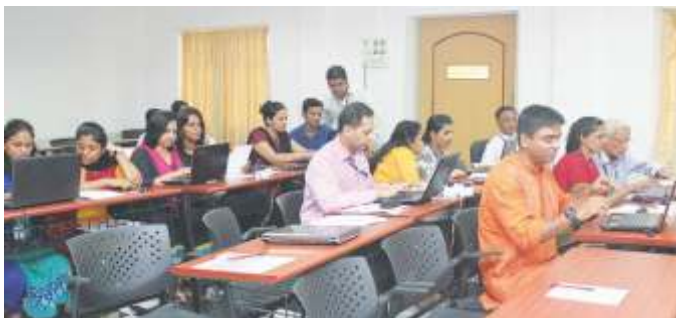
Faculty & Staff Members working on Group Assignments during FDP