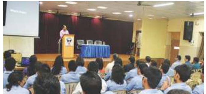
Prayer Session conducted at the commencement of MMS II & PGDM II Programme