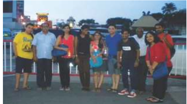
Students & Faculty enjoying the Cruise