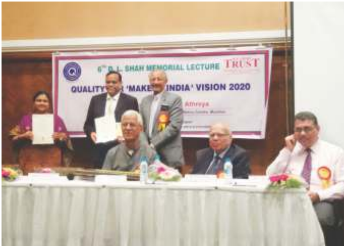
"Best Educational Quality Enhancement Team Award 2014" by National Centre for Quality Management (NCQM), Mumbai