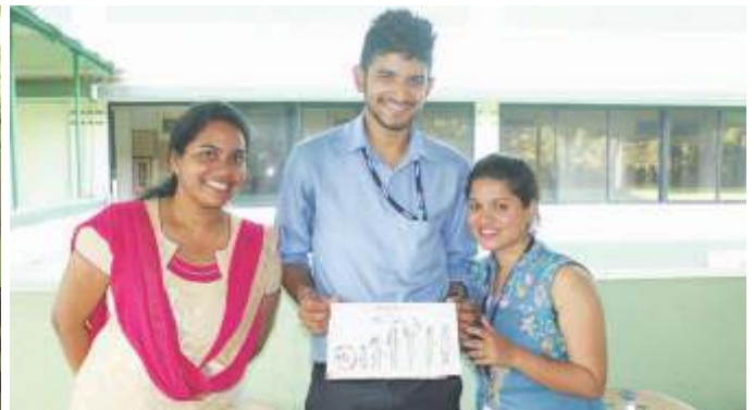
Students displaying their posters during the competition