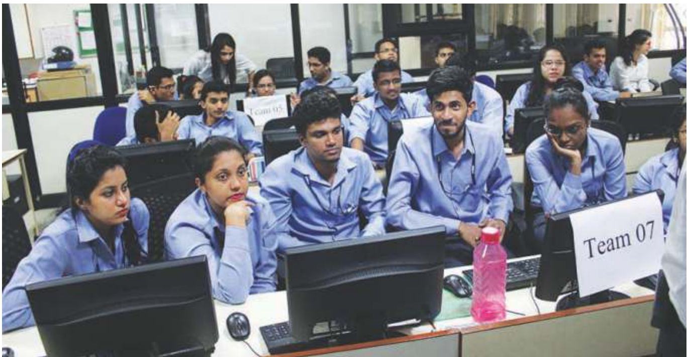
Students working on various Online Projects and Activities