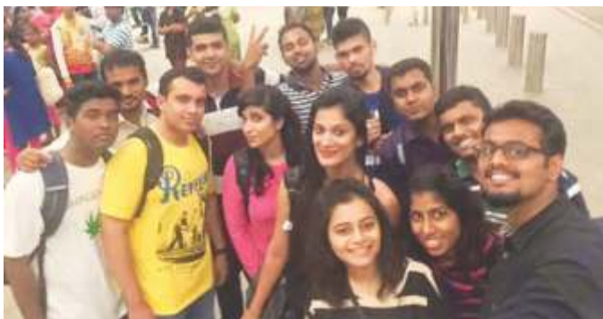
Selfie Click by students @ Bangkok