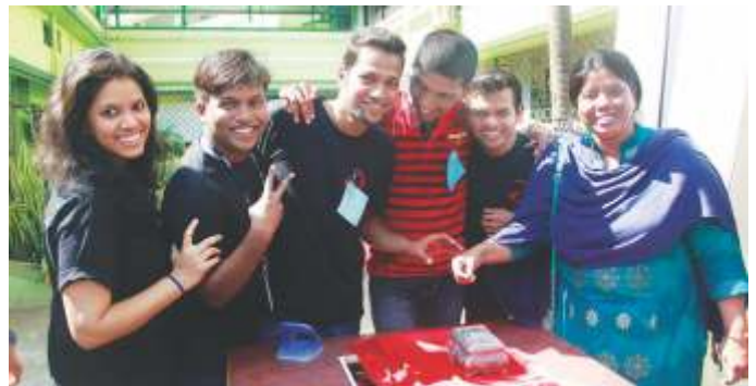
Maze Craze - Treasure Hunt Contest