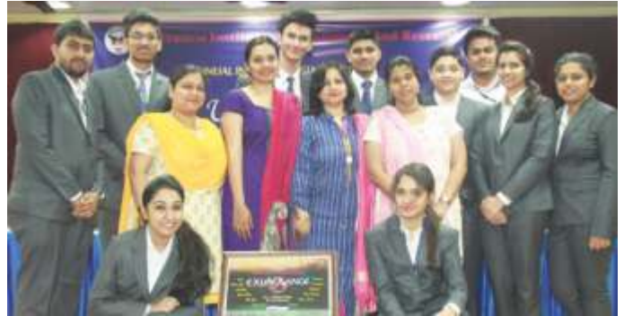
Faculty & Student Volunteers @ Exuberance