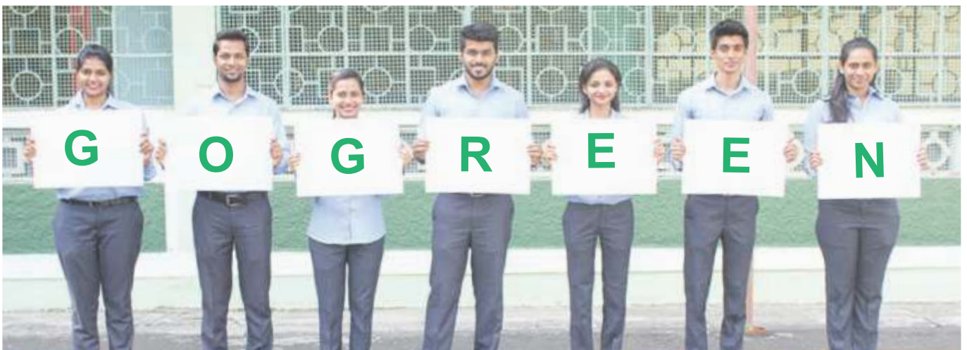
Green Club of SFIMAR undertakes Green Audits & Campus Management Activities