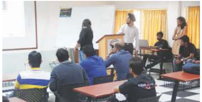
Grand Plan - Business Plan Competition