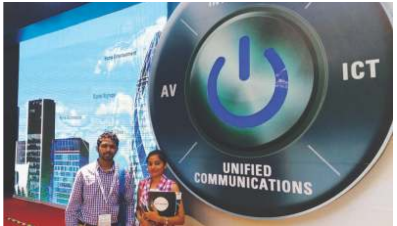
MMS (IT) students attended Infocomm International IT Summit, Mumbai