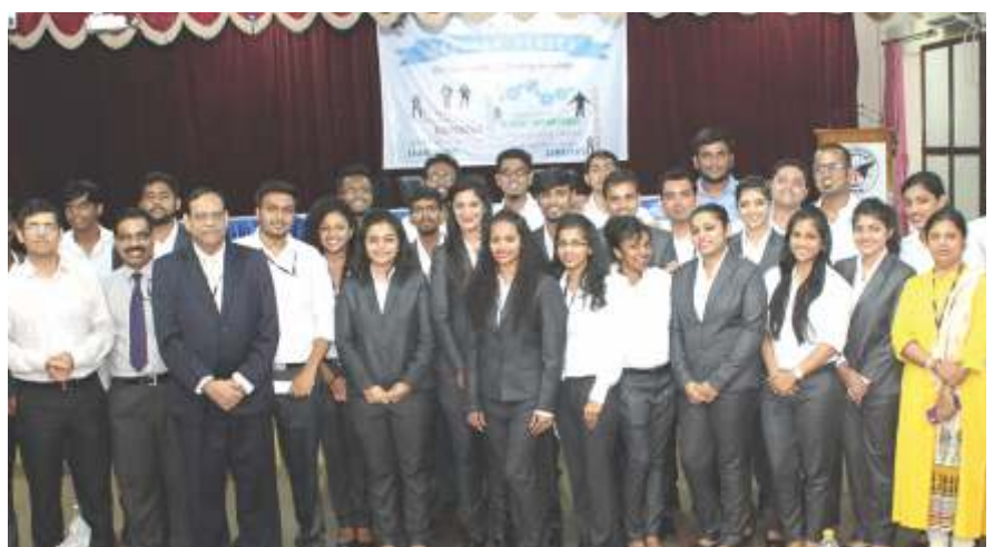
Group Photo - Director, Faculty, Staff Coordinators and Student Volunteers