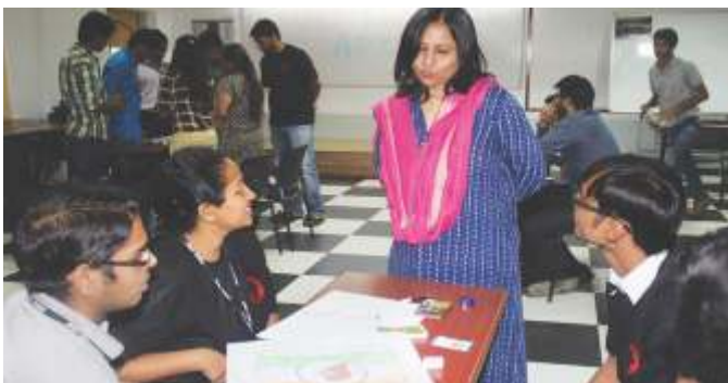
Adzilla - The Ad Mad Show