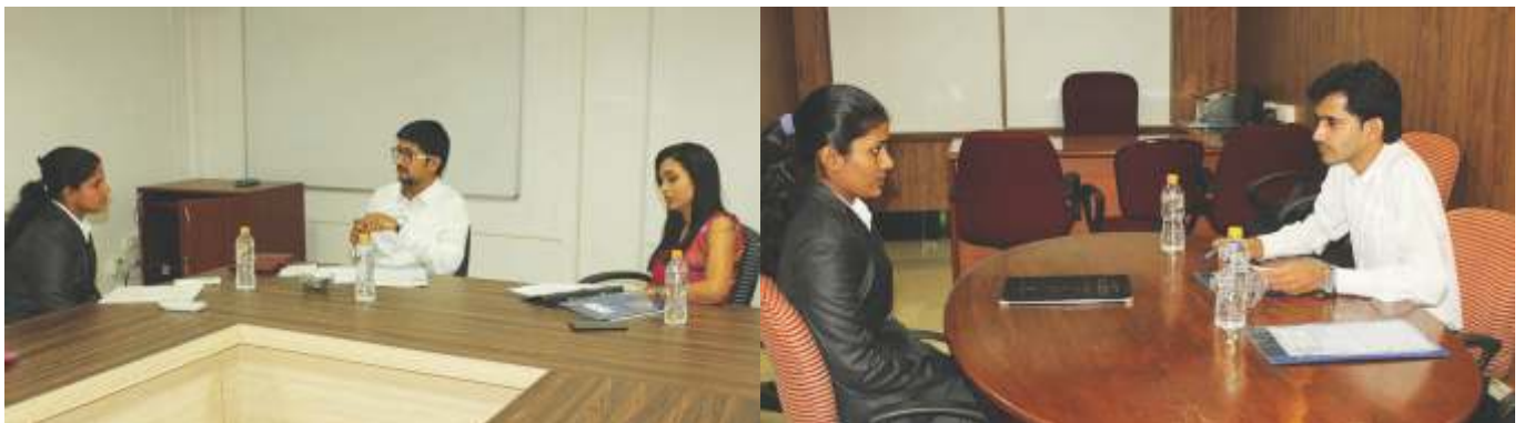
Mock Interviews conducted by Senior Alumni for students