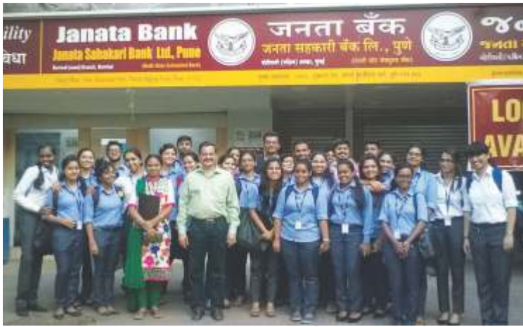
Field Visit organized for Students to Janata Bank