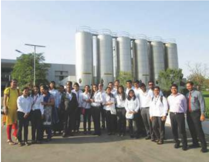
Industrial Visit to Amul Factory, Ahmedabad