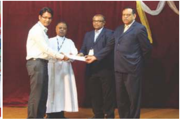
Students been awarded Completion Certificate for Corporate Onboarding Programme in association with GlobeOp