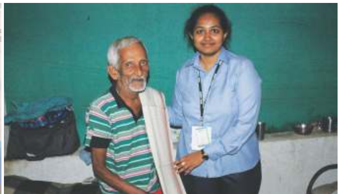
Student volunteer helping the senior citizen at Old Age home