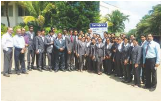
Industrial Visit to Samsonite, Nashik