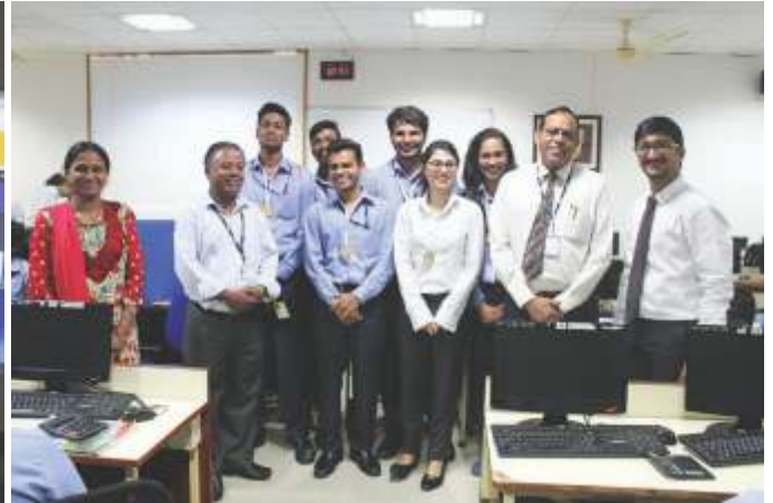
Finatics Forum organized an Mock Stock Competition for finance students