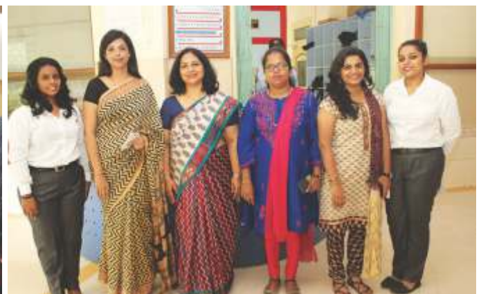
Group Photo - Organizing Team