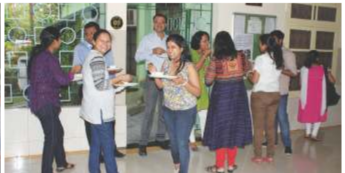
Students enjoying the refreshments