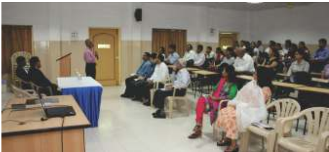
Academic Counseling Sessions are conducted for MMS & PGDM Aspirants