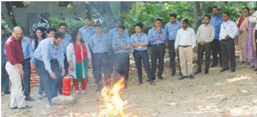
Fire Drill conducted for Faculty, Staff & Students of SFIMAR