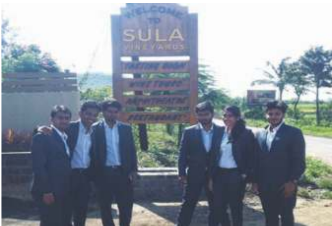
Industrial Visit to Sula Vineyards, Nashik