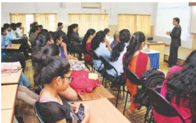
Corporate Panel evaluating Finance Projects