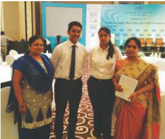
MMS (Opts) & PGDM students attended the CII conference at Mumbai