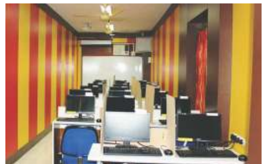
Digital Library @SFIMAR