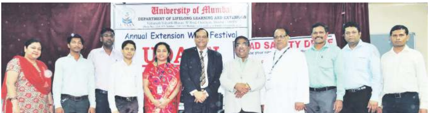
Organizing Team: - Udaan 2016, DLLE Annual Festival in association with University of Mumbai (UoM)