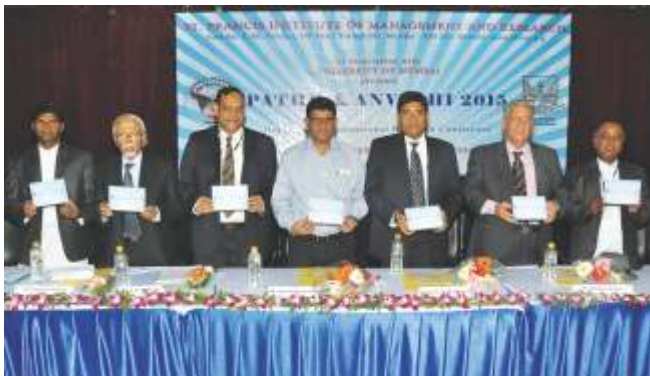
Unveiling the conference proceedings