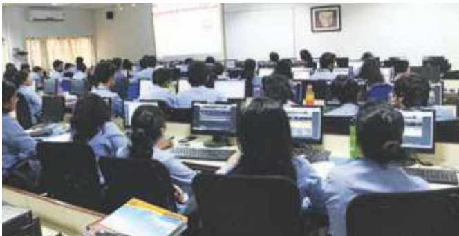
Add-on Certificate Courses in Securities Markets are offered to students in association with NISM & ICFL.