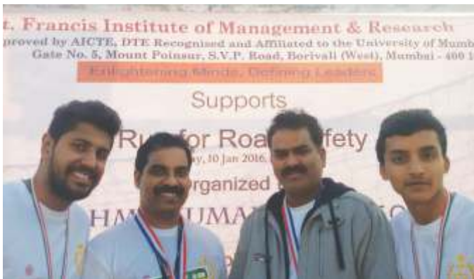
SFIMAR Students & Faculty participated in Run for Road Safety Marathon organized by Brahmakumaris