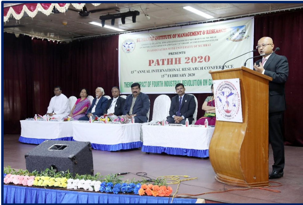
Address by the Guest at the Inaugural of Pathh 2020