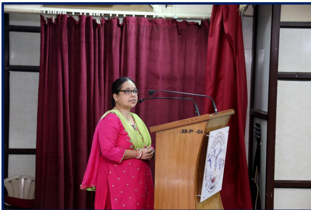
Paper Presentation at Pathh 2020