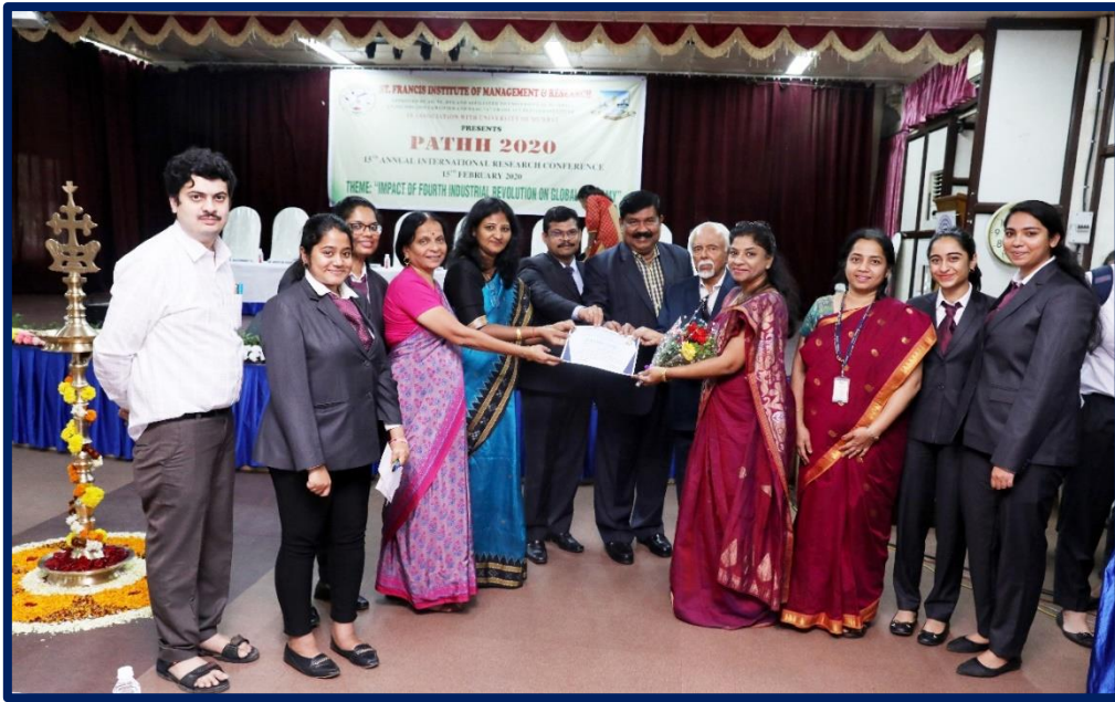
Prize Distribution Pathh 2020