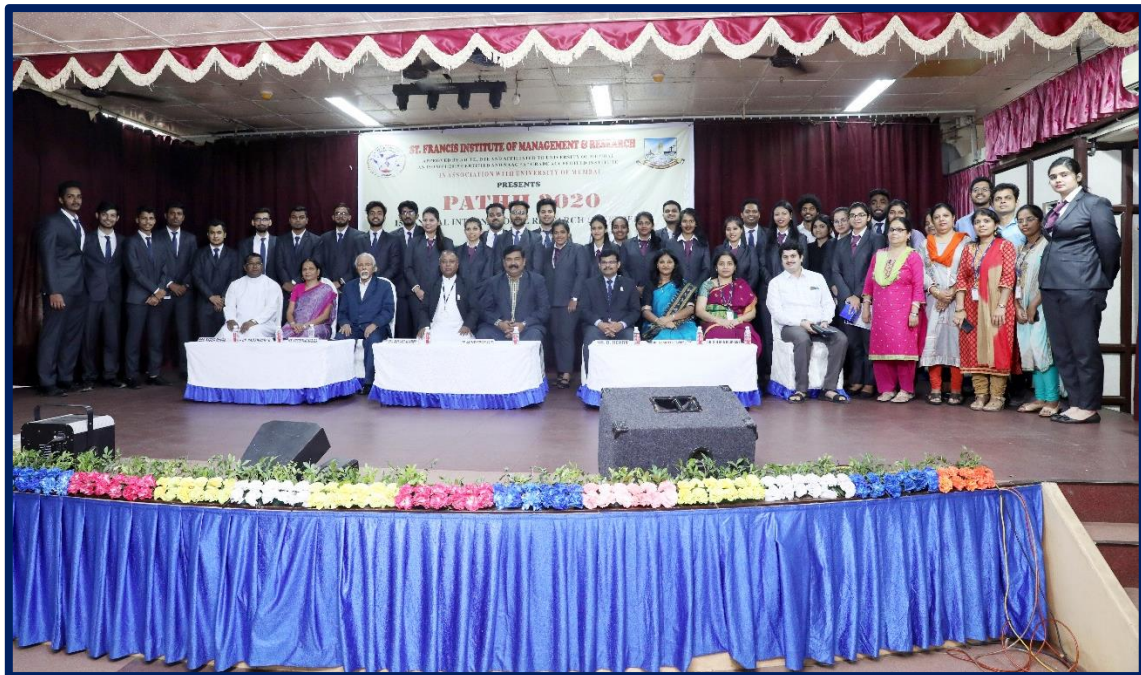
Organizing Team Pathh - 2020