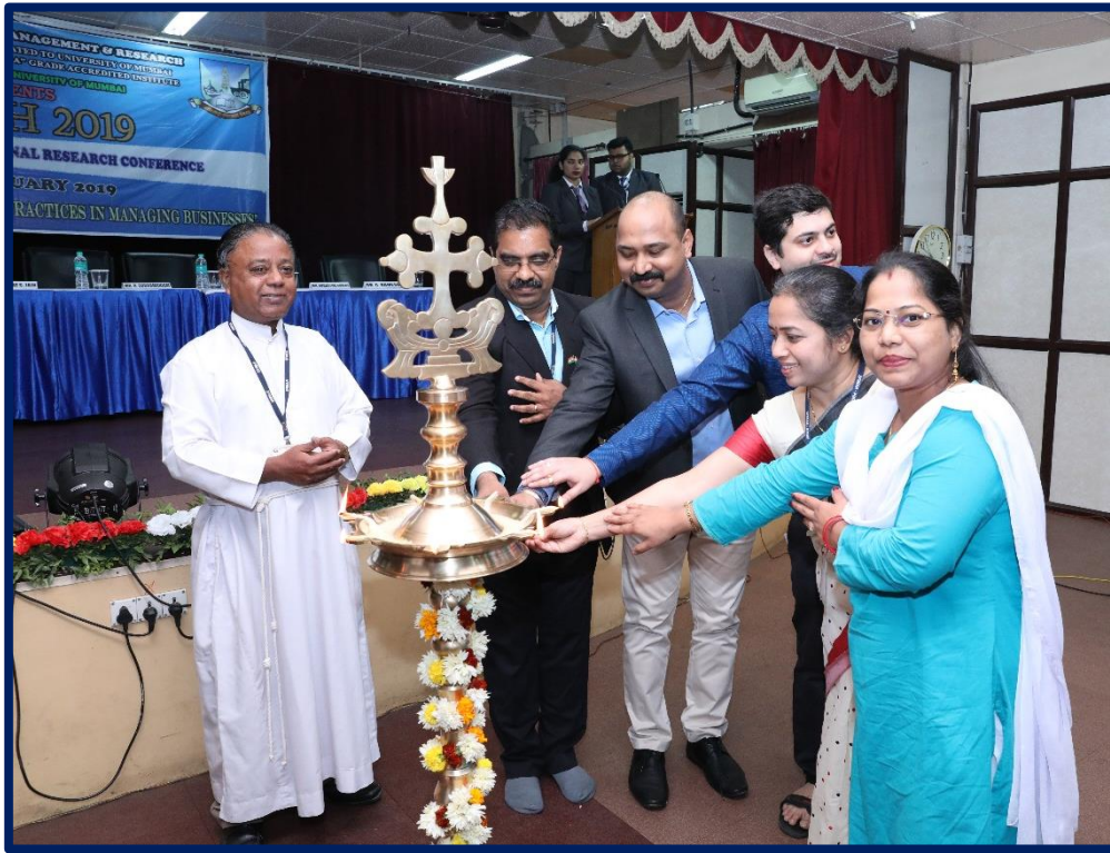
Lighting of the Lamp – Pathh 2019