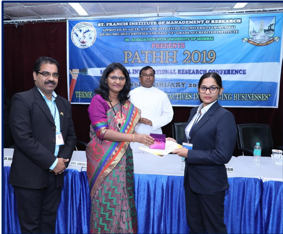
Certificate Distribution - Pathh 2019