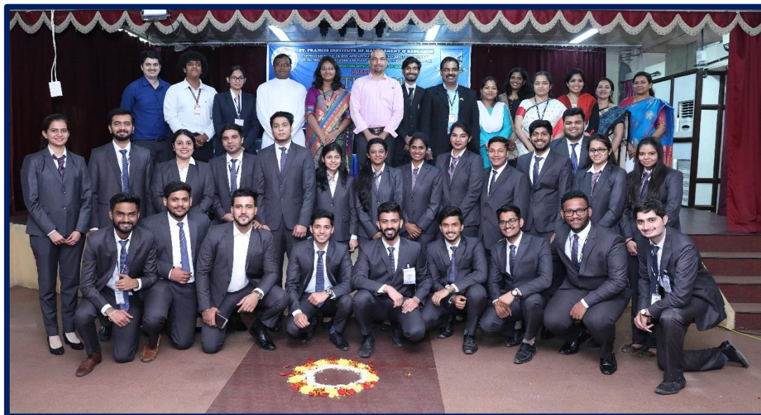
Organizing Team Pathh - 2019