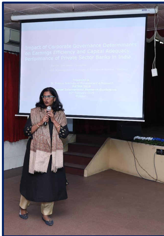
Presentation of Research Paper - Pathh 2019