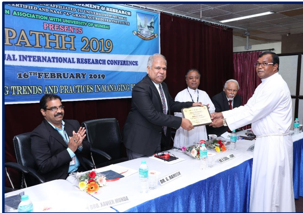
Felicitation of the Guest - Pathh 2019