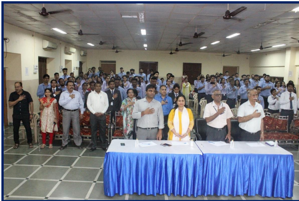
The Integrity Pledge on 1st November 2018