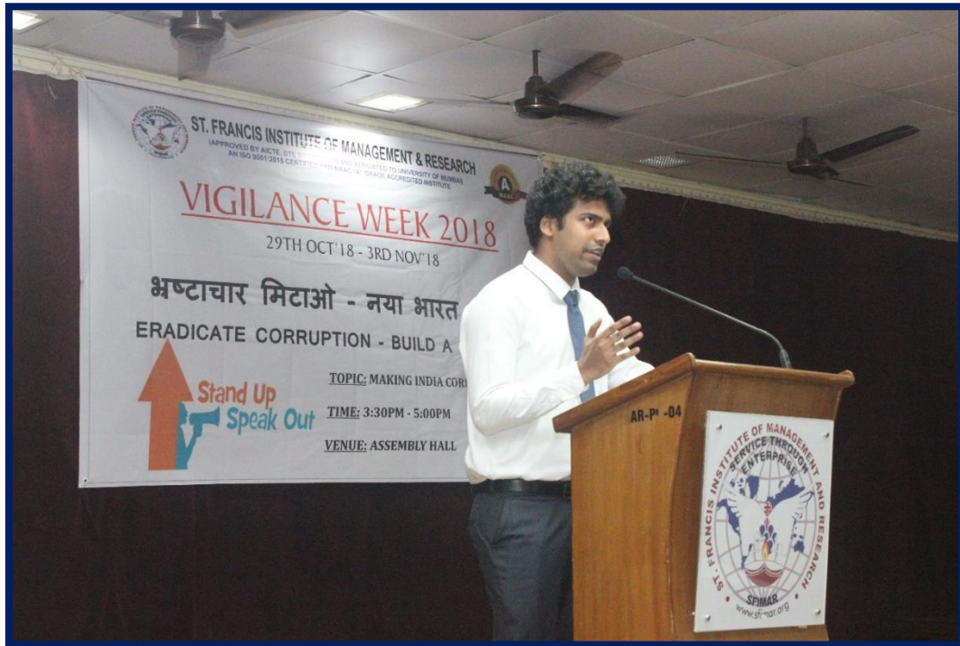
Elocution Competition on 1st November 2018