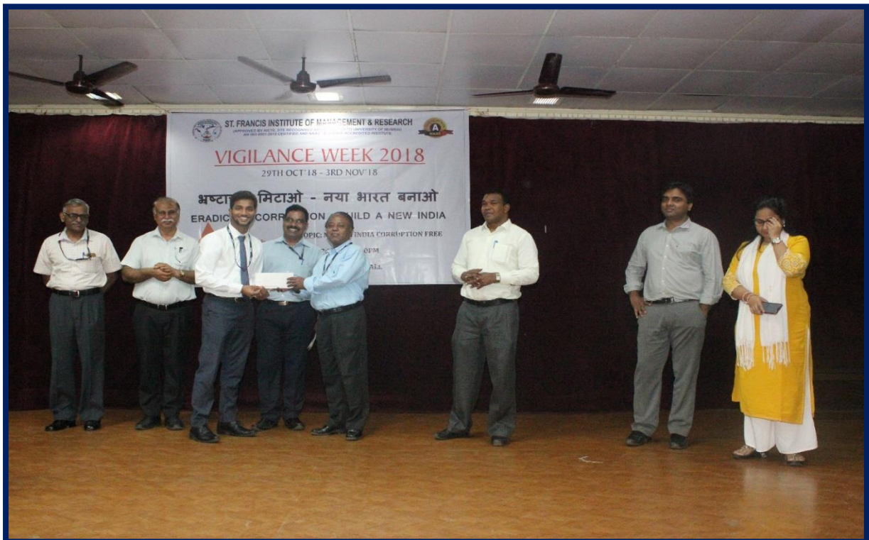
Felicitation of the winners on 1st November 2018